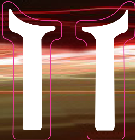
Road End Plug Lights